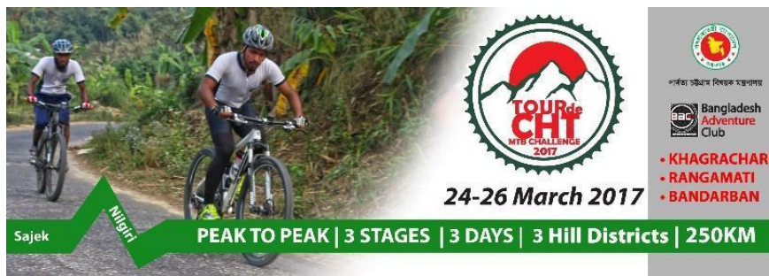
Figure 10: A poster for a cycling tour in the Chittagong Hill Tracts sponsored by MOCHTA.

resolving land conflicts or land loss of the Jumma peoples.