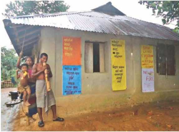
Figure 9: Jumma homes with posters protesting the government's proposal to take over 700 acres of land for tourism in Alutila, Khagrachari.