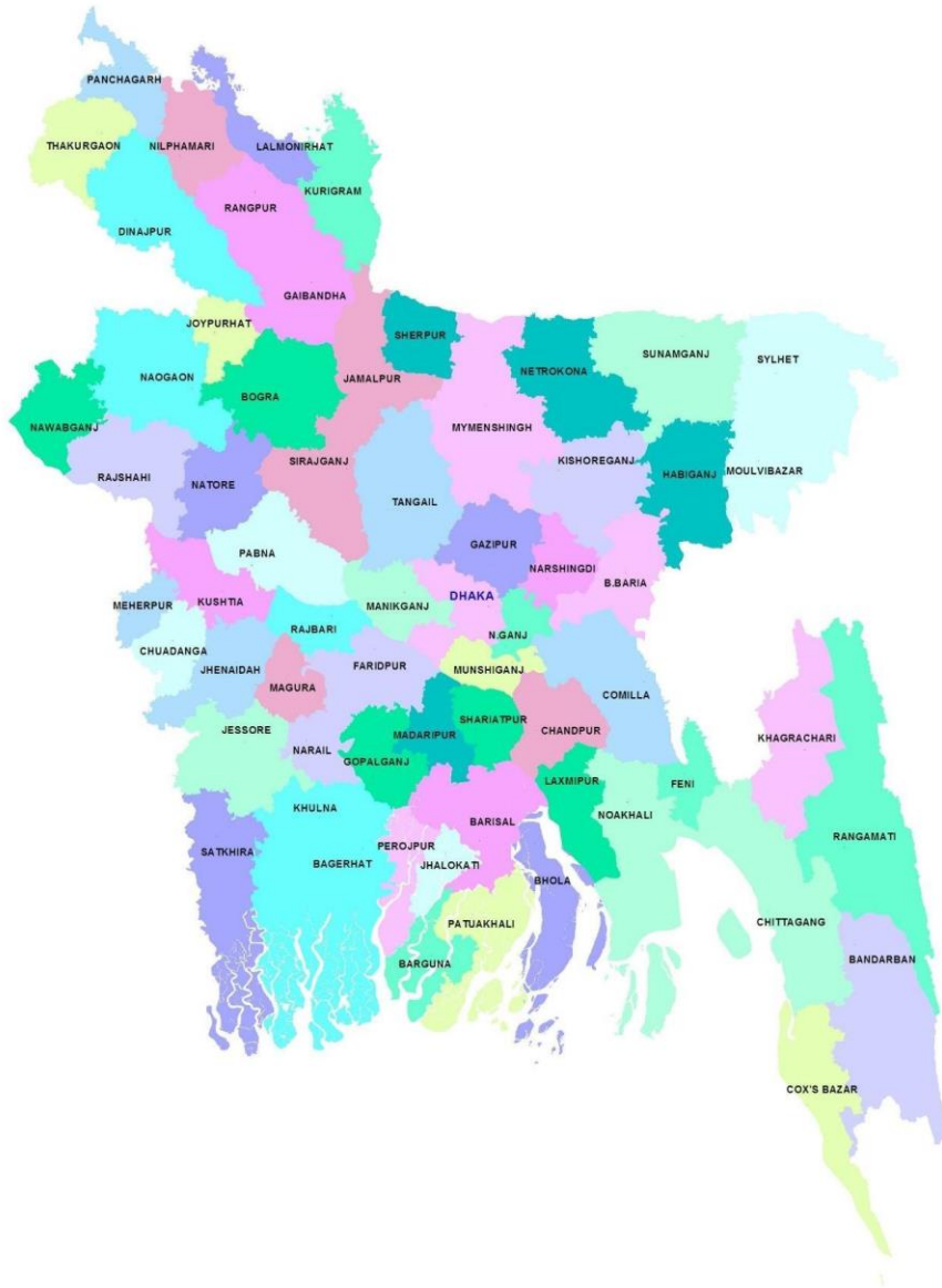
Map 1: Map of Bangladesh