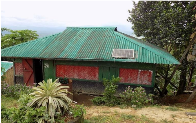
Figure 8: The military painted Jumma people's homes with red and green of the Bangladesh national flag.

[Fieldwork, June 2016, translated from Bangla]