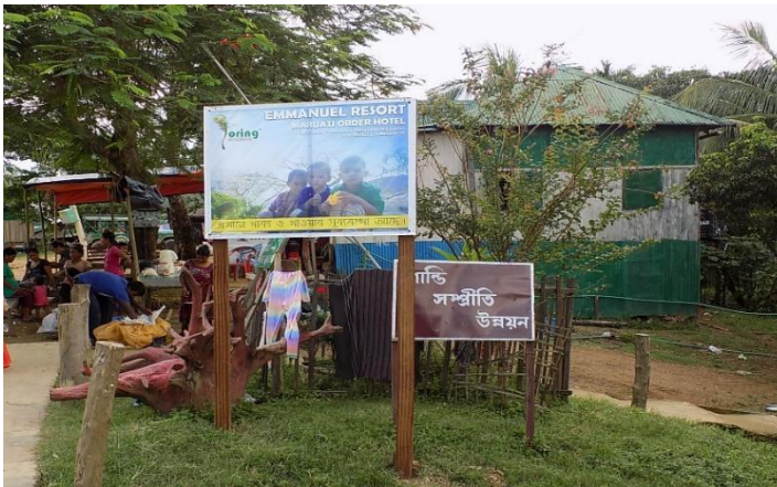
Figure 6: Military signboard saying ‘Shanti Shompriti, Unnoyon.’

Sajek unless they have booked rooms there.