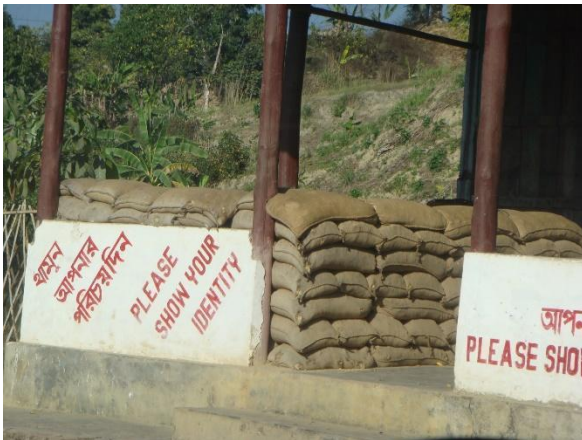
Figure 1: A military checkpoint in the Chittagong Hill Tracts.

on high alert. At the entrance to each of the three hill districts, the vehicle carrying us had to be registered and the foreign members of the Commission had to show their passports and register their names. Most Bengalis like myself living outside the Hills are unaware of the sharp contrast of living under military occupation as opposed to living under a civil administration in the rest of Bangladesh. When middle-class Bengalis do visit the area, they visit as tourists and their major concern is their own safety and thus they accept this militarization as a necessary tool to control the nation's Others on this frontier region and accept the meta-narrative of preserving Bangladesh's sovereignty. The state promotes the idea that despite the presence of 'terrorists', it is capable of keeping the area 'safe' and 'peaceful' for tourism.