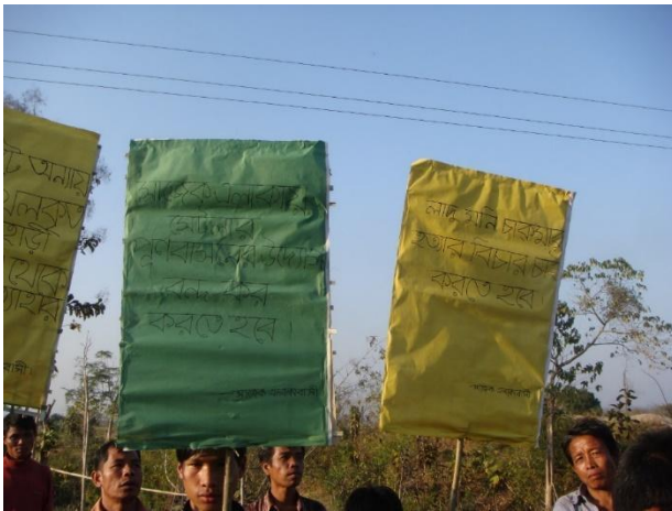
Figure 7: Jummas in Sajek protest state-supported land-grabbing and illegal settlement in 2011.

[Fieldwork, June 2016, translated from the Bangla by author]