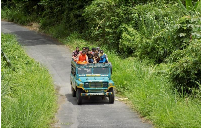
Figure 4: Young Dhaka-based tourists on top of a chander gari.