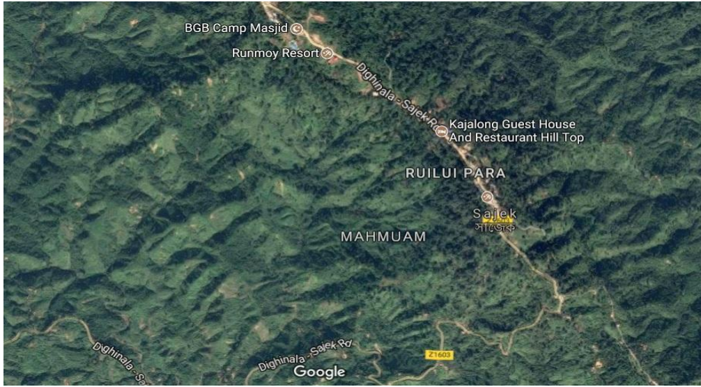
Map 4: Google Earth view of Ruilui Para, Sajek.