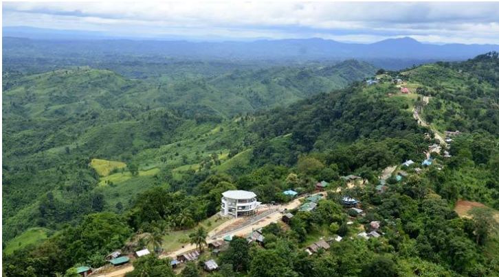
Figure 5: An aerial view of Ruilui Para, Sajek tourist area.