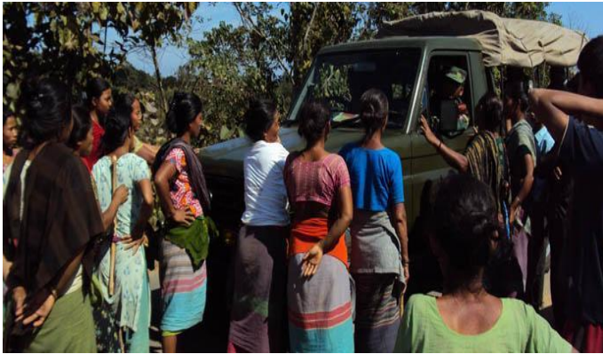
Figure 2: Women villagers in Sajek confronting a military vehicle in 2010 following an arson attack in their villages.

up and confined by the military. Women also played their part, they got together and resisted the aggression by the military. Despite the history of rape and sexual assault by the military during the armed conflict throughout the 1980s and 1990s, Jumma women have always put up a resistance to this violence.