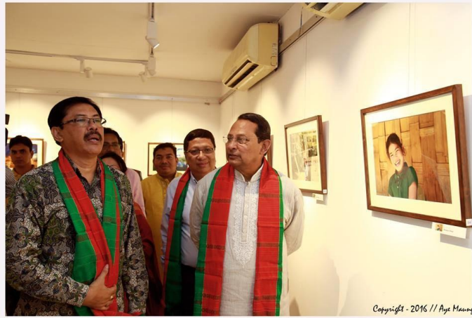
Figure 11: Photo exhibition at Dhaka DRIK Gallery in July 2016 being inspected by the Minister for Information, the Minister and Secretary for CHT Affairs and the press. The dignitaries are wearing red and green (the color of Bangladesh's flag) hadi (Chakma shawl)