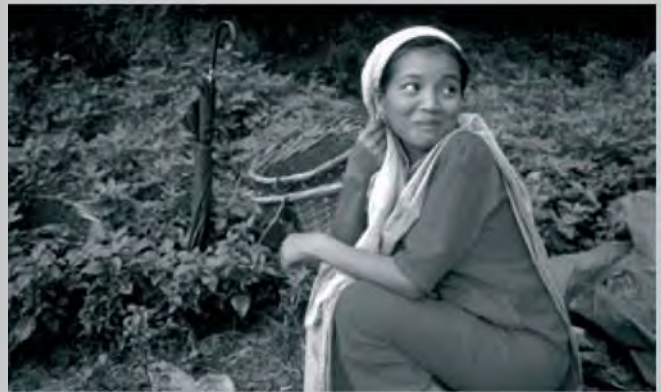
Young Khasi woman.

Ri Bhoi is one of the state's seven districts. It is located in the north of East Khasi Hills District, on the slope leading down towards the plains of Assam. Ri Bhoi is inhabited mostly by Khasi. But there are also other indigenous groups such as the Garos, Karbis, Marngars, Mikirs, Bodos and Lalungs. According to local sources, the non-Khasi indigenous communities were later settlers in different parts of Ri Bhoi.