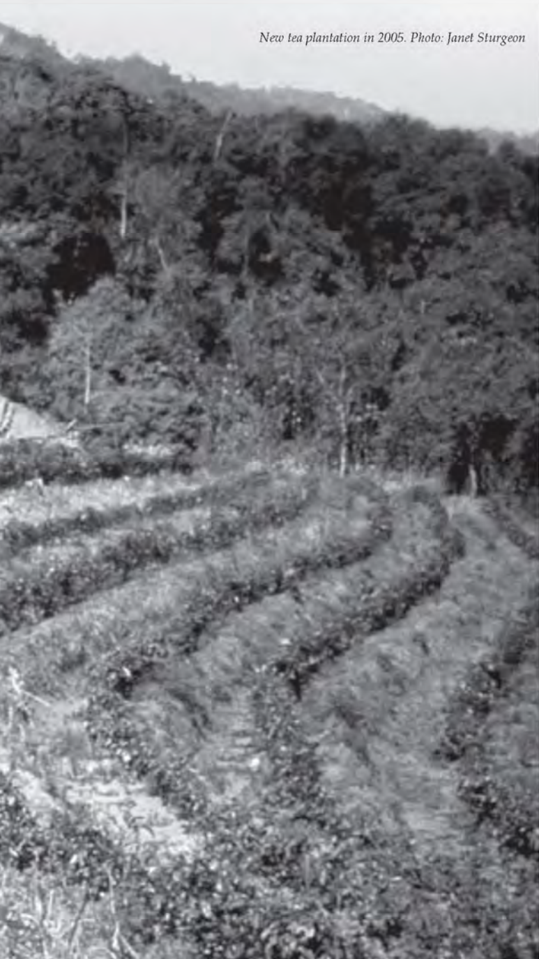
New tea plantation in 2005.