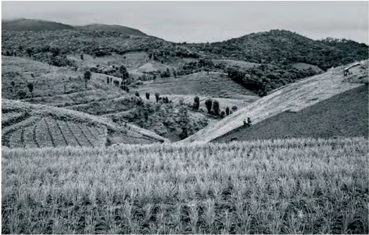
Intensive upland cash-crop farming has been introduced to replace shifting cultivation.