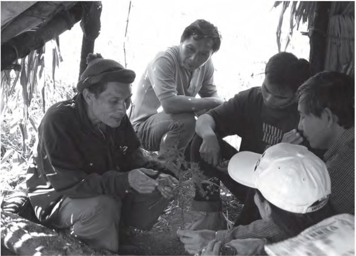
Sharing the elders' knowledge.

over by black pine. We walked to the south-west of the village, an area reserved for rotational farming. A group of three generations of farmers guided us to their swidden fields. During the walk, they showed and explained to us the diverse uses and meaning of trees, plants, animals, insects, streams and farming areas.