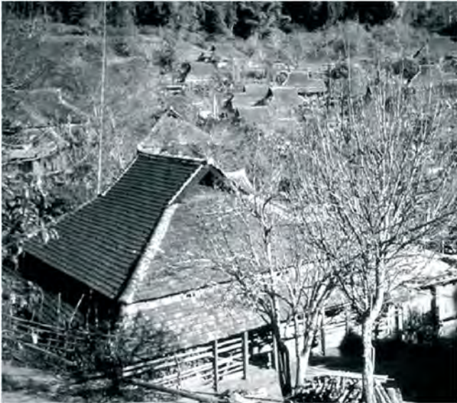
The Akha village Mengsong in Yunnan.