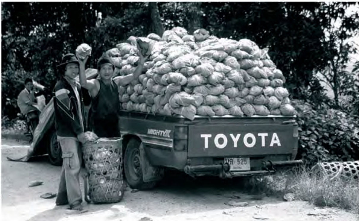
Cabbage harvest to be sold on the lowland market.