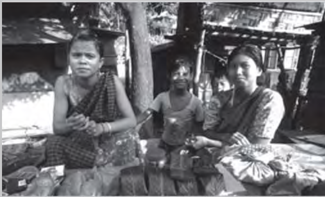
Khasi women selling betel nut and tobacco, Ri Bhoi District, Meghalaya.