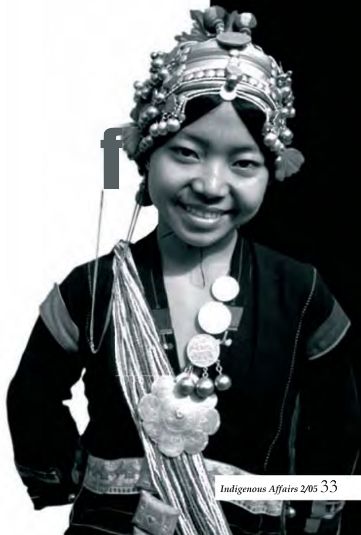
Akha girl. Luang Nam Tha province, Laos.

Village consolidation means that two or more villages are resettled to one location. Remote and small mountain villages are usually resettled to the lowlands, close to a road or a market. "Village consolidation is officially phrased as a necessary means of reducing the adverse environmental impacts of shifting cultivation in remote areas" 13 and is considered to be a cost-effective way of making development services available to scattered