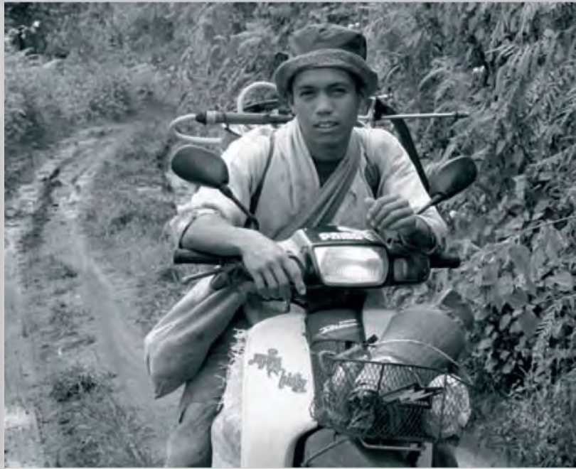
Vegetable cash crops need heavy inputs of agrochemicals: young Lua farmer returning from spraying his field.

province, a series of pressures on local land use developed between 1957 and 1998. Three consecutive logging concessions operating from 1957 to 1978 drastically deteriorated the forest ecosystem. Between 1969 and 1996, teak plantations by the RFD encroached into the village's fallow land. In 1981, Doi Suthep-Pui National Park was established and expanded its area into the village's cultivation area in the following year.