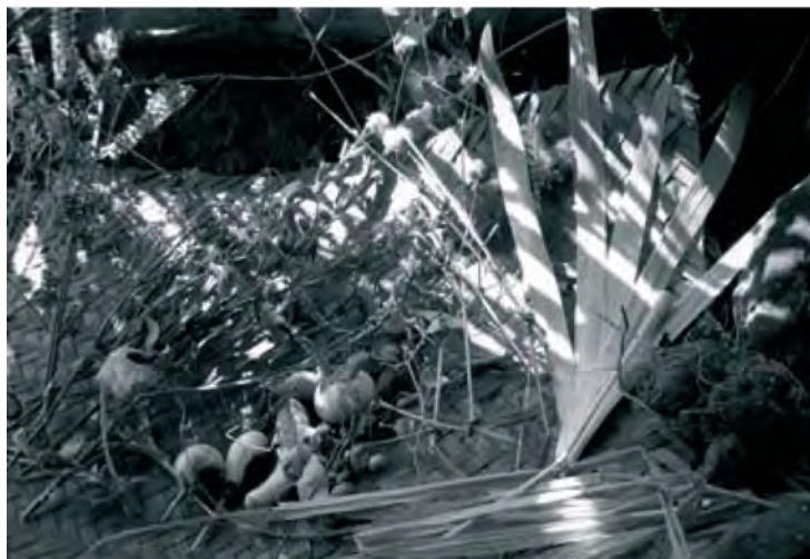
Many kinds of vegetables, spices, herbs, tubers and flowers are gathered from the swidden field even long after the main harvest.