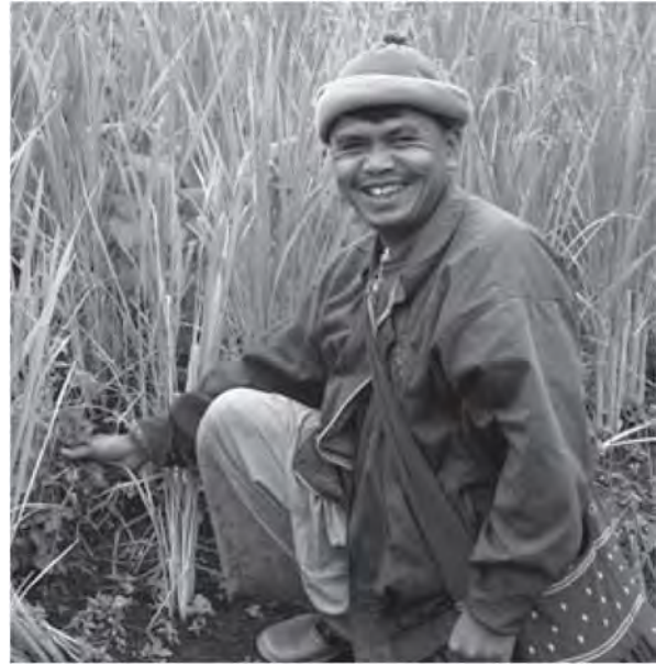
Proud owner of a rice swidden: Lua swidden farmer from Mae Hong Son province.

Swidden agriculture is commonly held to be the primary cause of forest destruction in Asia. In Indonesia, swidden agriculture was seen by the Dutch colonizers as "the robber economy" since it competed with the colonial state for the use of forest resources. 1 In India, the traditional practice of swidden farming was perceived as the most "destructive" form of agriculture by the British foresters, particularly during the period of British expansion of forest exploitation into mountainous areas. 2 In Thailand, the term " rai luan loy ", literally "drifting field", is used in official discourse to refer to what they see as a "slash-and-burn" farming method practiced by the hill tribe people 3 in mountainous areas. Such a term carries the ethnocentric pejorative connotation of swidden agriculture as being "nomadic" and "temporary" 4 as opposed to the assumed "permanent" agriculture of the lowland communities. As a result, since 1985, Thailand's national forestry laws and policies have been hostile to swidden agriculture. With little understanding of their traditional land use systems, many government programs have combined the resettlement of hill tribe villages with forced conversion of swidden cultivation into permanent agriculture. The implementation of these programs reflects the state's pejorative view of tribal people by associating local practices of mobility and swidden agriculture with a presumed "threat" to national security and "deforestation".