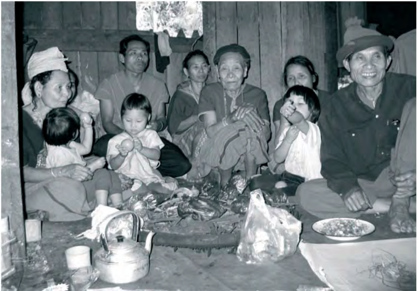
In the kitchen: three generations get together, singing songs for the cucumber, the eggplant, sesame...