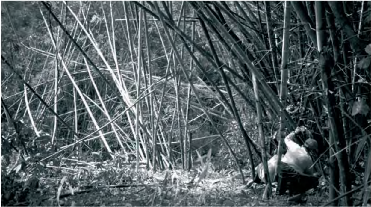
Akha man cutting bamboo to prepare a new field.

livelihood, resettled shifting cultivators try to find government-compliant livelihoods. Villagers having the means either buy paddy land in the plains or join relatives in other villages (if they are accepted by the village council). In one village, the poorer part of the village was left behind. Some looked desperately for another place to go, others did not want to leave but, with the exodus, the minimum number of people fell below 150, making the village a future target for relocation. And many of those with enough money had to realize that there was not enough paddy land available.