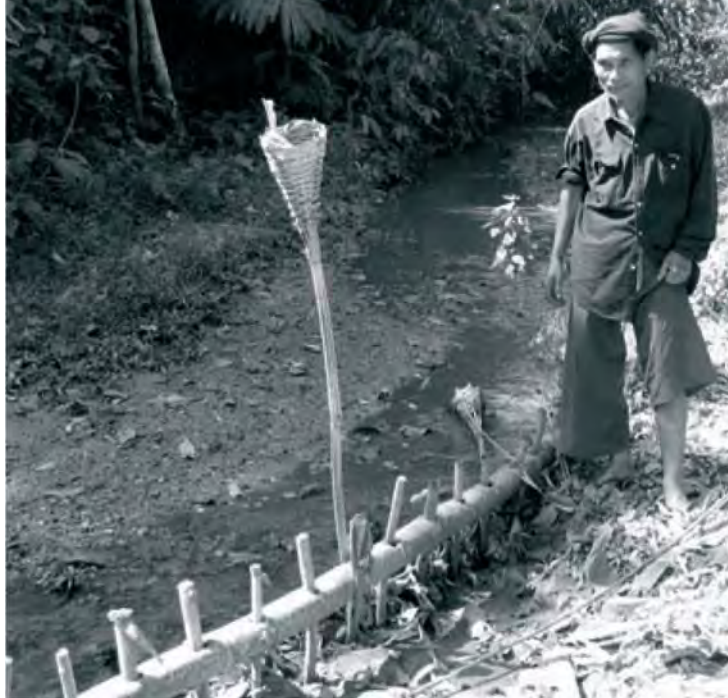
Each place has a economic and symbolic meaning: Ritual site at the junction of two streams.