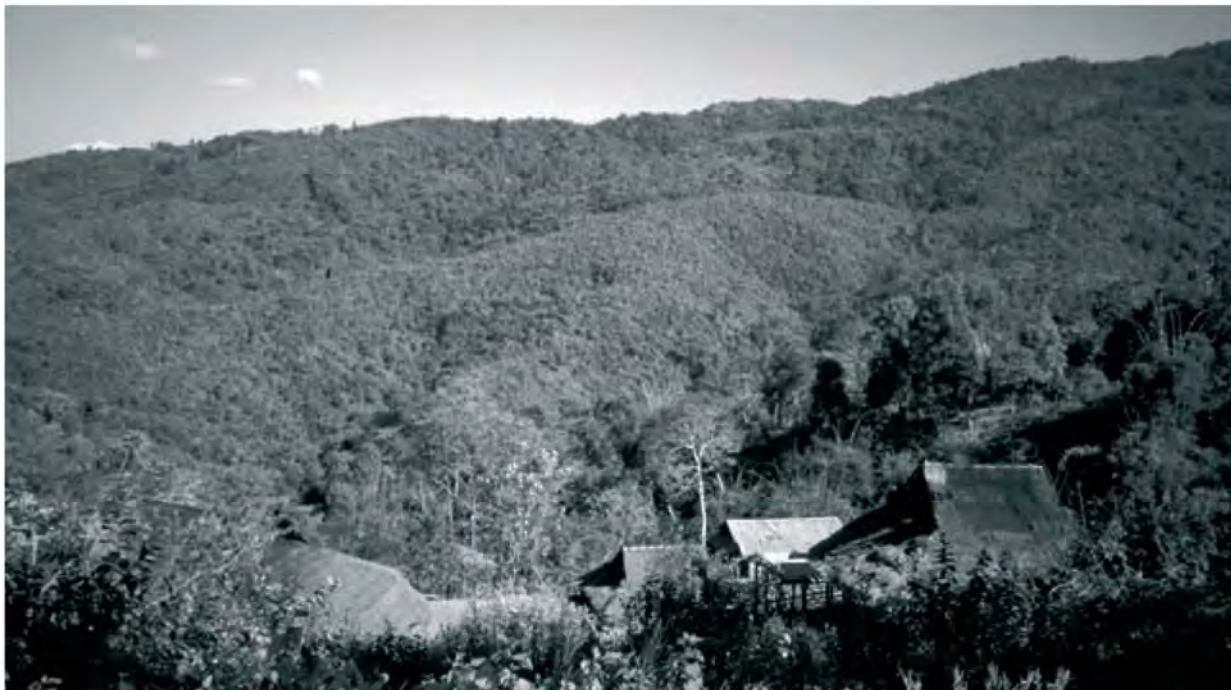
Akha village in the mountains of Luang Nam Tha province, Laos.

and remote communities that would otherwise not be reached with the limited resources available.