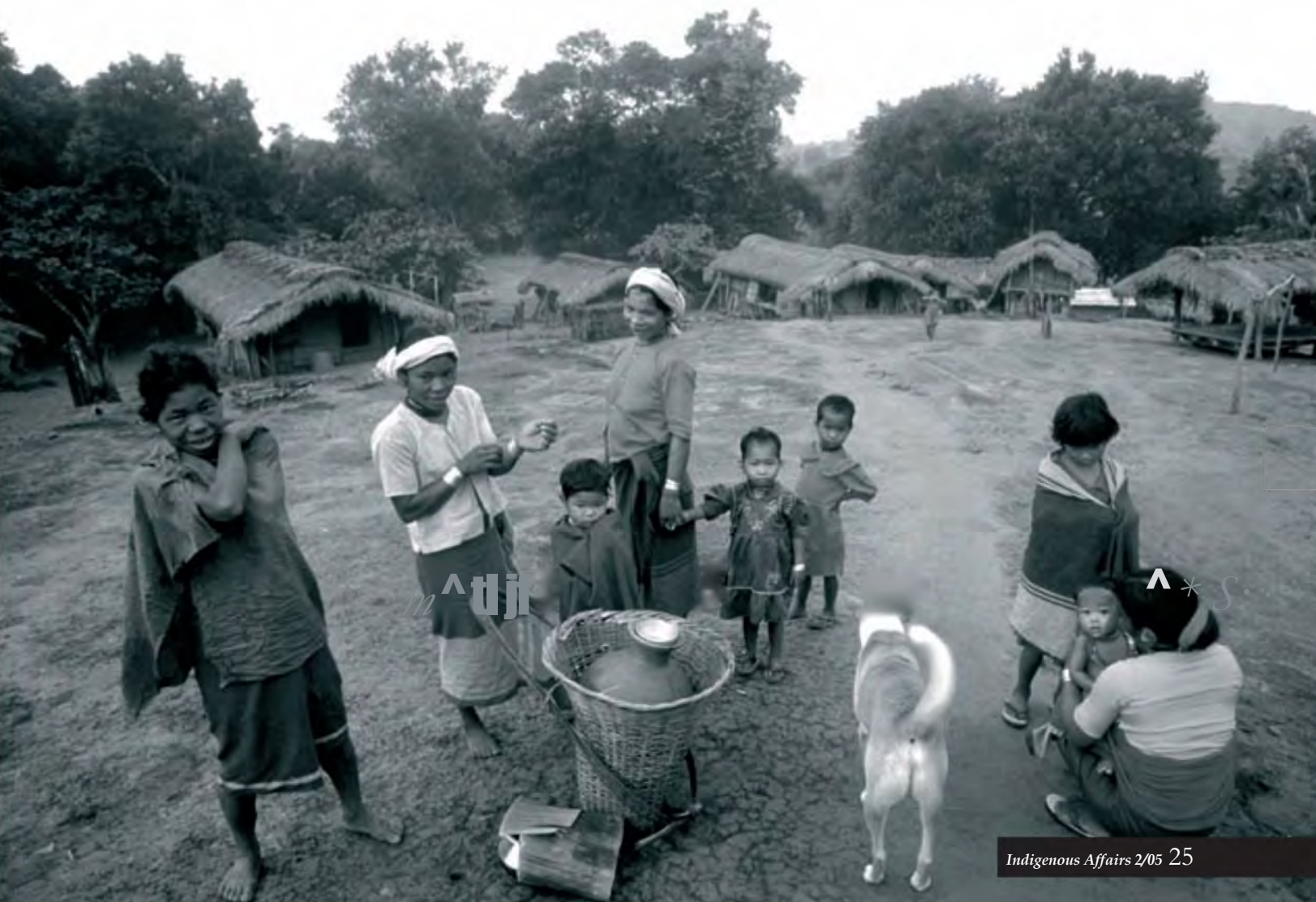
In a Garo village.

The counter argument, that of the destructive nature of shifting cultivation, is age-old. My answer is that shifting cultivation has become destructive because of ill-conceived policies and inappropriate interventions in