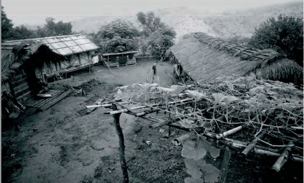
Khasi homestead in Ri Bhoi District.