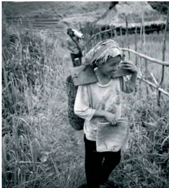
Akha couple returning from the field.

cipality ruled by Tai people who are socio-culturally closely related to other Tai groups in neighboring countries of mainland Southeast Asia. 3 An array of other ethnic groups inhabit the uplands, such as Akha, 4 Lahu, Yao, Jinuo 5 and Bulang. All of these peoples were considered "barbarians" on the frontiers of the Chinese empire. Most of them originated in what is now China and later spread into contiguous hilly parts of Burma, Laos, Thailand and Vietnam. For centuries, upland farmers in Sipsongpanna practised shifting cultivation. Even many of the lowland Tai planted both wet rice fields and shifting cultivation lands until the 1980s. Before 1950, primary tropical and subtropical forests carpeted both the valley and surrounding mountains in Sipsongpanna.