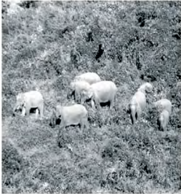
Elephants feeding in a fallowed swidden field. West Garo Hills, Meghalaya