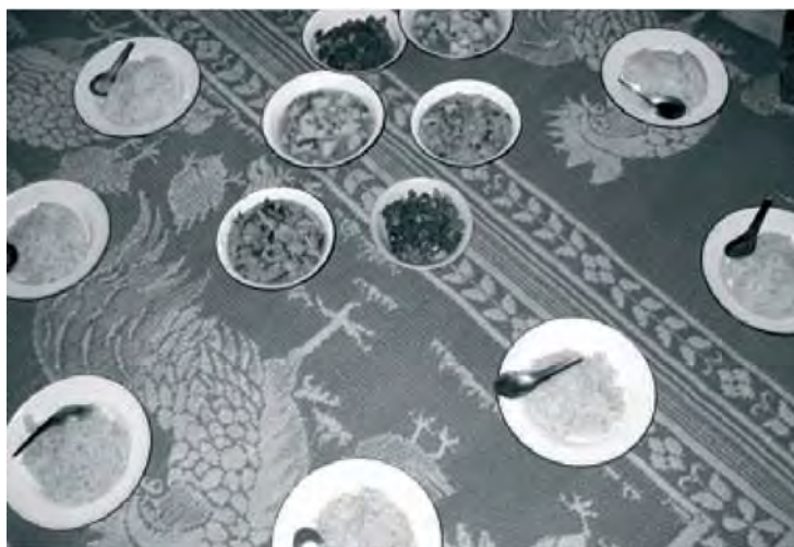
Food sovereignty - to decide what to eat: swidden rice and vegetables from garden, field and forest.