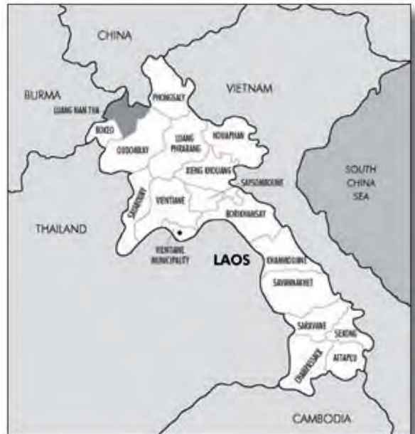
Resettled Akha village. Luang Nam Tha province, Laos.