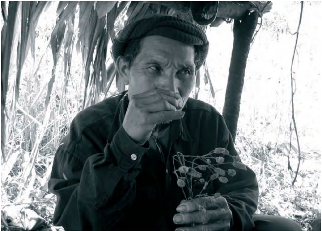
Recalling and using all senses is part of biodiversity conservation.