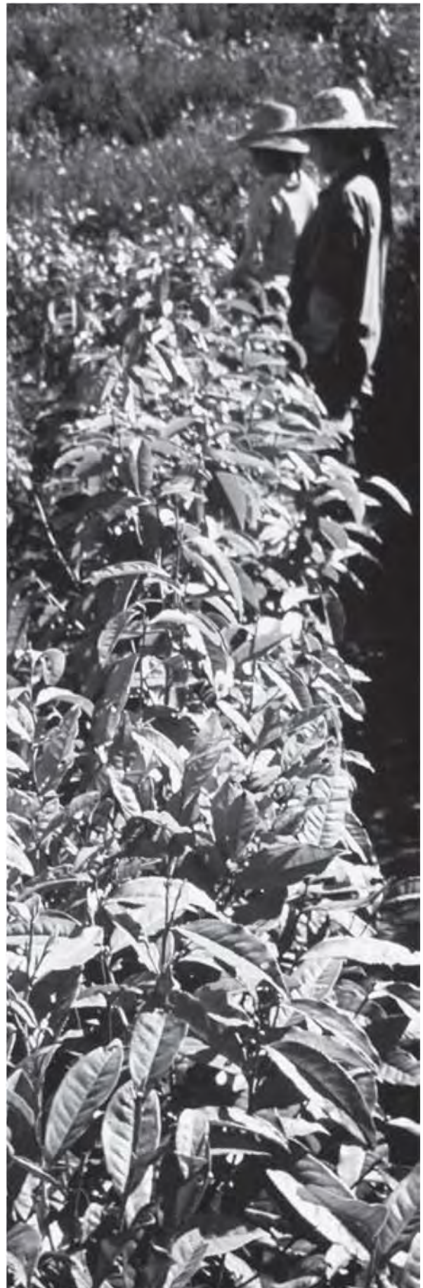
New tea garden in Mengsong

In sum, the overall outcome of the timber ban, the Grain for Green program and the poverty alleviation program has been a simplification of the cropping system by replacing biodiverse shifting cultivation lands and pastures with monoculture tea. How this came about involves a murky story of township administrators convincing farmers to give up their land to regenerate into forest, even though the Grain for Green program had not yet started in their township. Township administrators also claimed any fallowed swidden lands with ma-