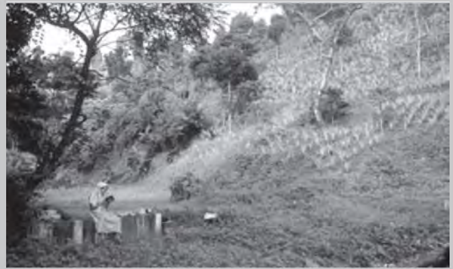
A cash-crop field with pineapples in Ri Bhoi District, Meghalaya.

The Land Reforms Commission Report of the Government of Meghalaya described the rights to land as follows: "If a person vacates or does not make use of the land under his/her actual occupation for three consecutive years, the land reverts to the community – village, Raid or Elaka (administrative unit) as the case may be. There is no proprietary, heritable or transferable right on the Ri Raid land". 2 It further states that the right to use the Bri Raid is based on that person's membership. A person belonging to Khasi society does not enjoy the right to use the above said land if that person is not a member of the village, Raid or Elaka . Non-Khasi are not allowed to use the Ri Raid . The village headman or the head of the Raid does not have the authority to grant such permission.